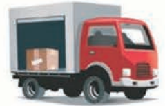
2. PACKAGE DELIVERED TO LOCKER