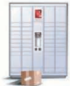
4. RESIDENT RETRIEVES WITH PIN