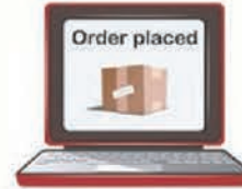
1. RESIDENT ORDERS PACKAGE